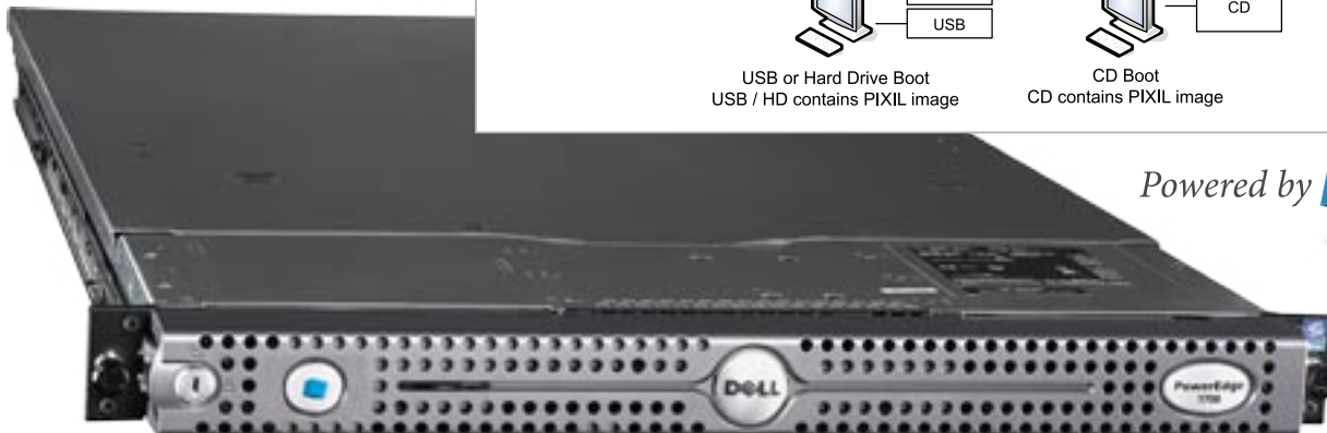
Dell PowerEdge 1750